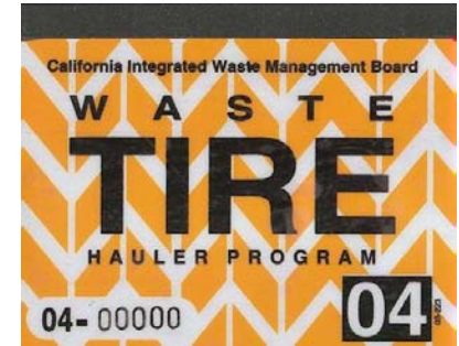
Official Waste/Used Tire Hauler Sticker which is affixed to lower right corner of the windshield.