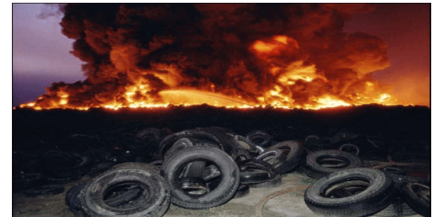
Tire fire at an improperly maintained storage facility.